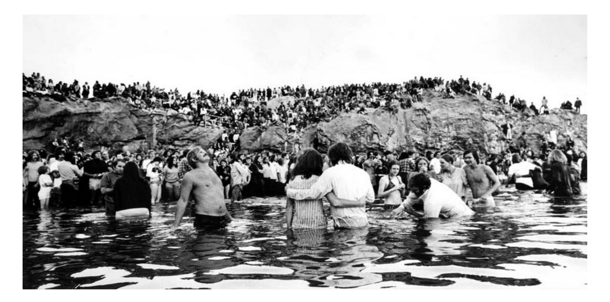
May 5, 1973: Several thousand Calvary Chapel members line Corona del Mar beach for baptism ceremony.